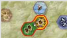
Forest + City side

Before mixing in the new double tiles, first remove a certain number of the original tiles from the game without looking at them: with 4 players, remove 16 tiles (instead of 4), with 3 players, remove 20 tiles (instead of 8) and with 2 players, remove 24 tiles (instead of 12). Only then do you mix the new double tiles with the remaining double tiles to form the face-down draw piles.