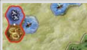
Mountains + Hills side

You can connect to this later in the game, just as you can connect to the terrain spaces printed on the board. No tile can be placed adjacent to this tile at the beginning of the game!